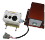
Tray Collision Warning System