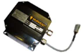
Fuel Cap Isolation