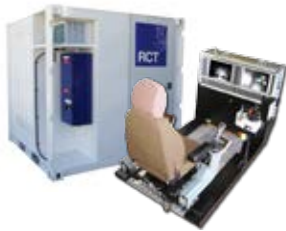
Teleremote Control Systems