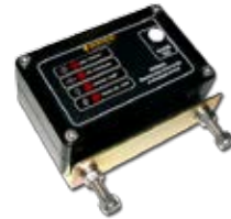
Engine Protection Systems