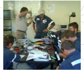
Product Skills Training