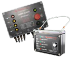
Laser Guard Barrier Systems