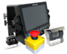
Electrical and Electronic Solutions