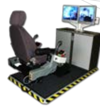
Fibre Optic Surface Solution